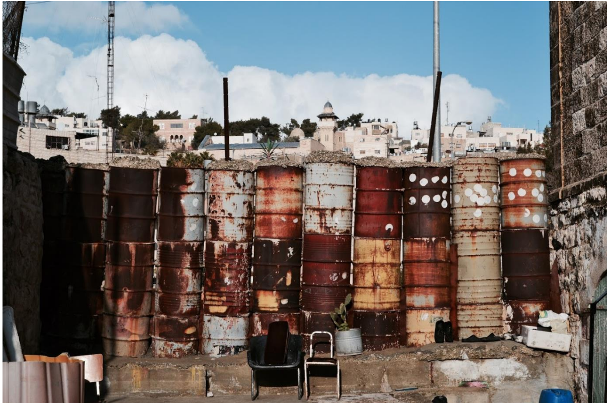
Makeshift wall in Hebron dividing Palestinians from Israeli settlers