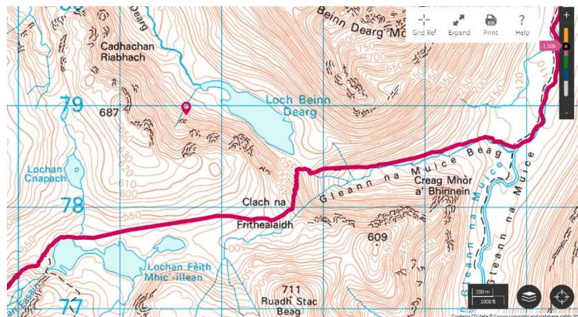
Detail from OS Map route of St Maelrubha 1 pilgrimage

Not least, in the 'Great Wilderness' east of Poolewe, my pilgrimage for St Maelrubha was reduced to a slow walk as I ascended the Clach na Frithealaidh. Here I was about a kilometre from the most remote part of the British mainland to the west of Loch Beinn Dearg. And yet, this path is less than 9km from the nearest road to the south-east — perhaps more relevant, the path itself is well-used, and the heather had recently been burned back, the most obvious sign of ongoing estate management.