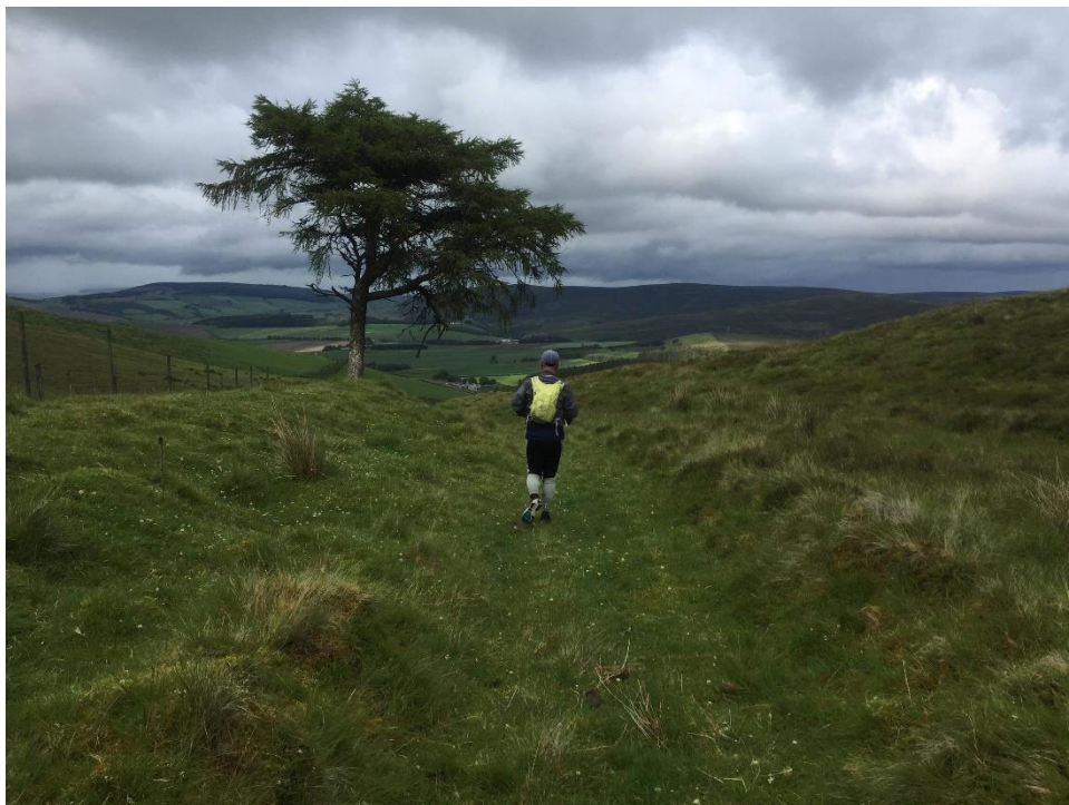
St Drostan pilgrimage near Glenfiddich

Not being myself Roman Catholic, I nevertheless discern in the credencial -Compostela system a clue to the experience of authenticity in Christian pilgrimage even, as in Running Home, when some of the routes are created by the individual pilgrim and some of the saints' biographies are mostly lost in fanciful legend. Specifically, I'm asking whether the Church might be the grounds of the authentic Christian experience of pilgrimage, even where the ecclesiologies behind these discourses may differ widely?