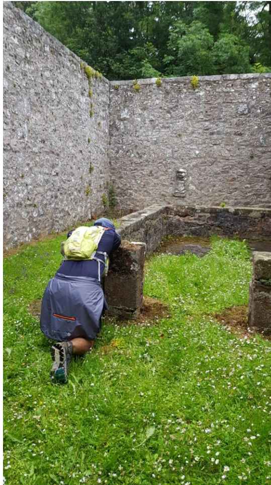
St Drostan pilgrimage, Old Deer.