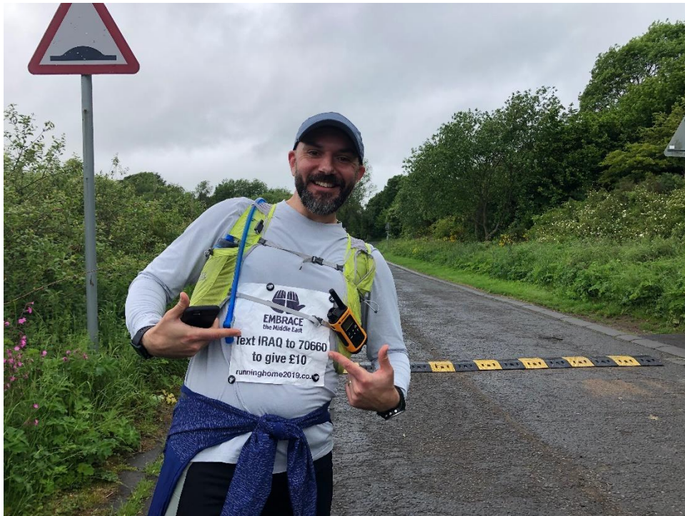
Fundraising on the St Columba pilgrimage, near Cleish, Fife