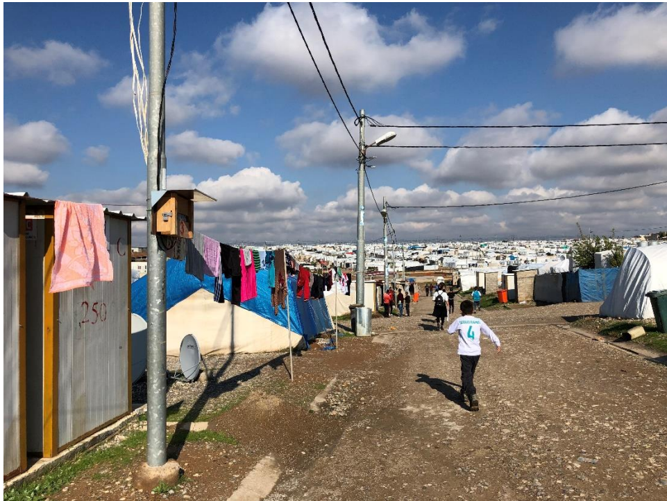
Refugee camp, northern Iraq

as at the heart of pilgrimage, 6 and involuntary, forced displacement. And yet, as we have seen, it is impossible to lose sight of their radical difference from one another: indeed, there seems to be a danger of insulting the violent experience of refugees by straining this analogy to the point of vulgar comparison.