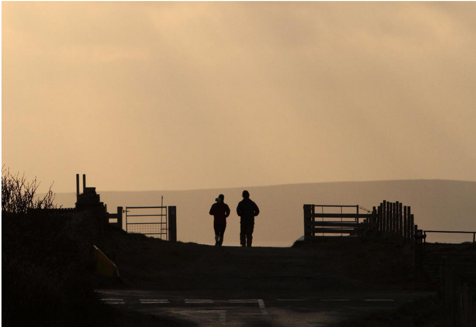
St Magnus pilgrimage, Egilsay

had compared with me, the Church becomes the place in which our journeys are connected. The identity of St Ninian may mostly elude me, but the contemplation of what we share and what we do not share, both being held together in the identity of Christ, enables a humble acknowledgement of participation in the same endeavour, and thus a sense of solidarity that is not borne of domesticating a mysterious saint for my own purposes.