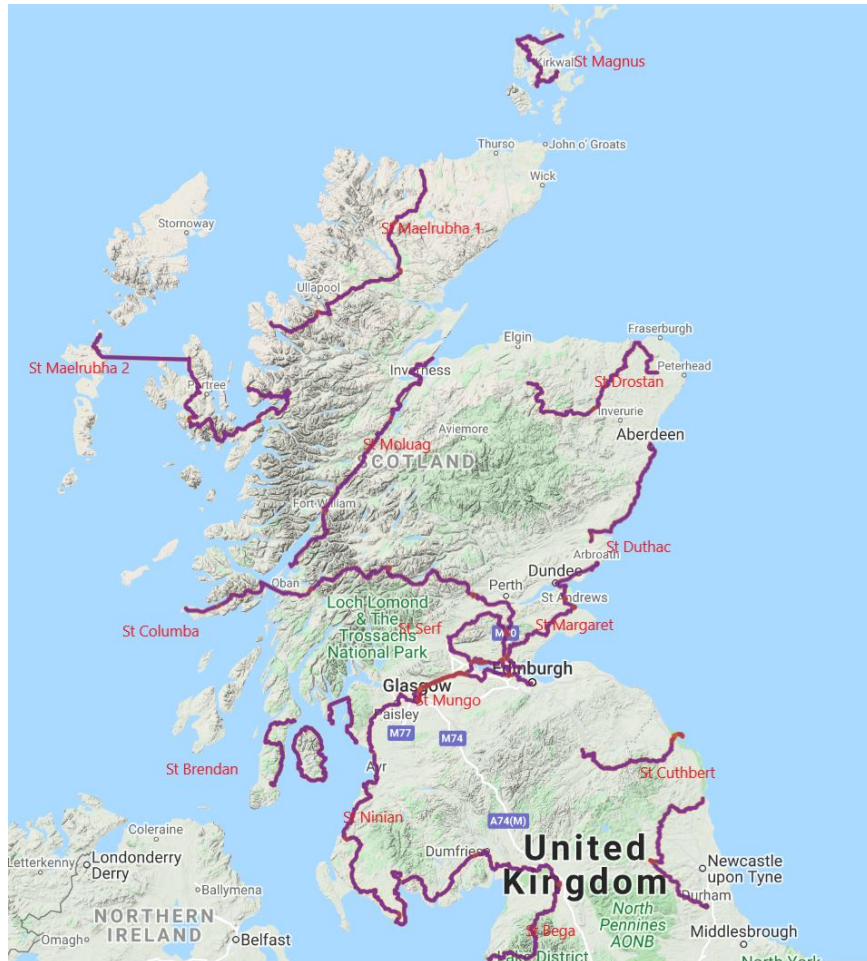
The fourteen pilgrimage routes as run, including unplanned breaks between Brechin and Arbroath, and Lindisfarne and Warkworth.

as a pilgrim last year and asks whether this is a useful framing for other Christian pilgrims.