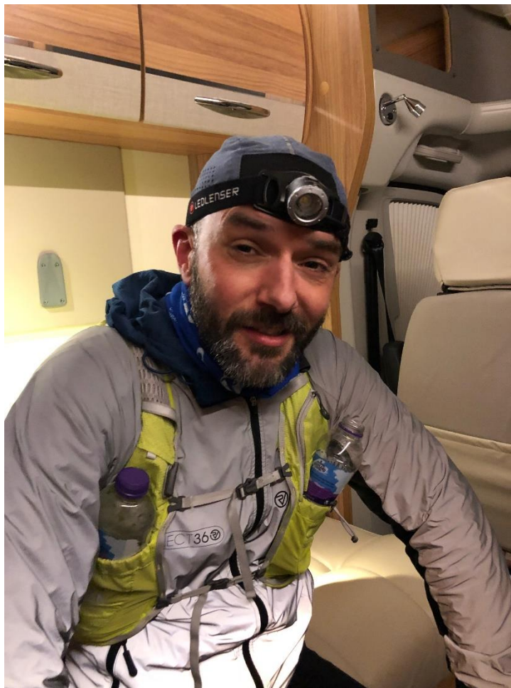
'Headwind face' on the St Duthac pilgrimage, Leuchars

These words burst from my dry mouth at an especially low ebb. I had been running since dawn, when I left Aberdeen, and it was now dark, cold, and nearing eleven in the evening. The headwind persisted, as it had all day, and I was off my intended route, on the A92, somewhere west of Arbroath.