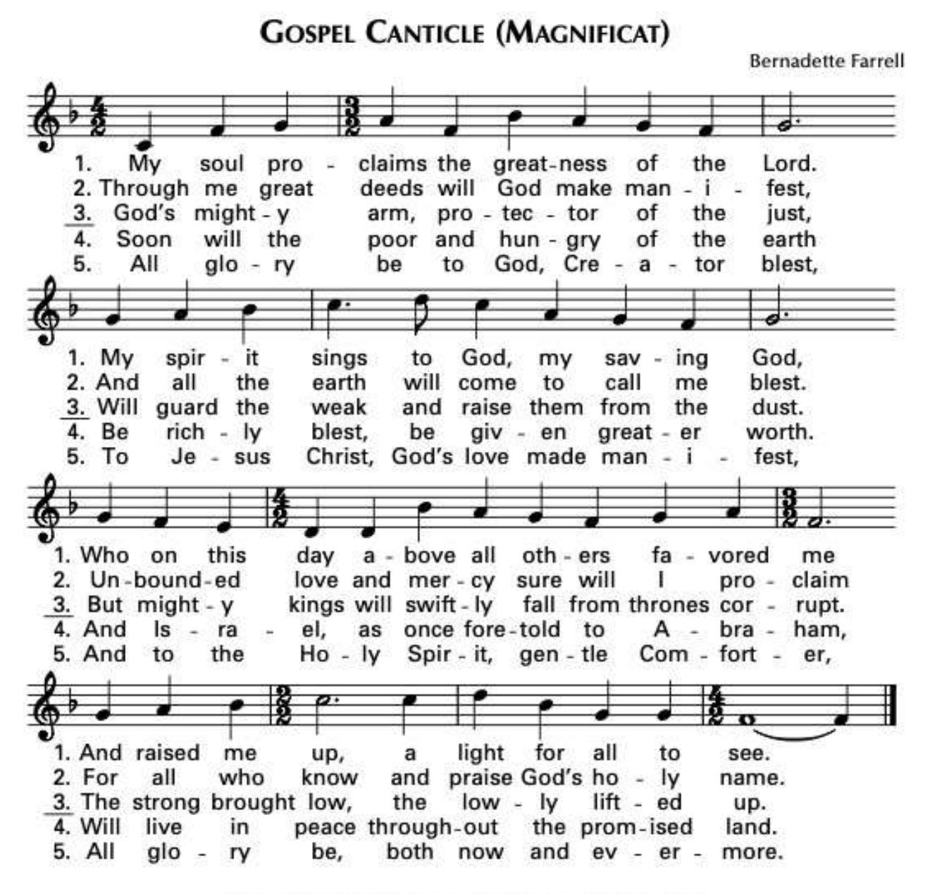
Text © 1993, Owen Alstott. Music © 1993, Bernadette Farrell. Published by OCP Publications. All rights reserved.

Reprinted with permission under ONE LICENSE # A-735695. All rights reserved.