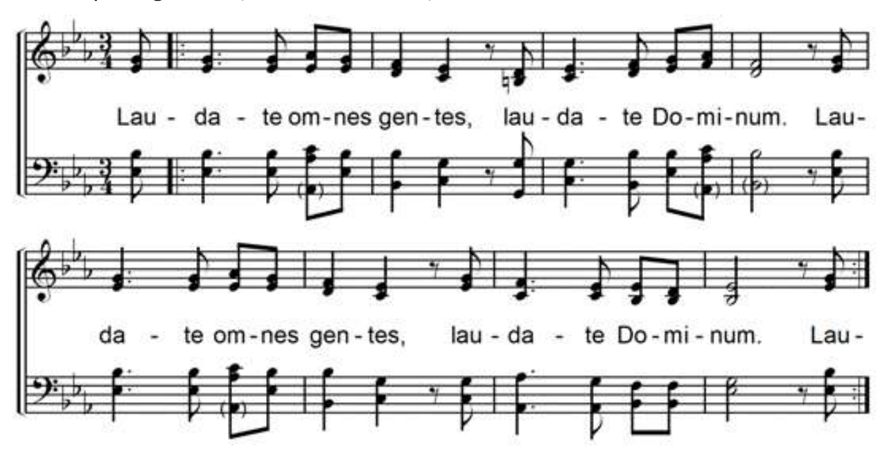
Taizé Community © 1979, Les Presses de Taizé, GIA Publications, Inc.